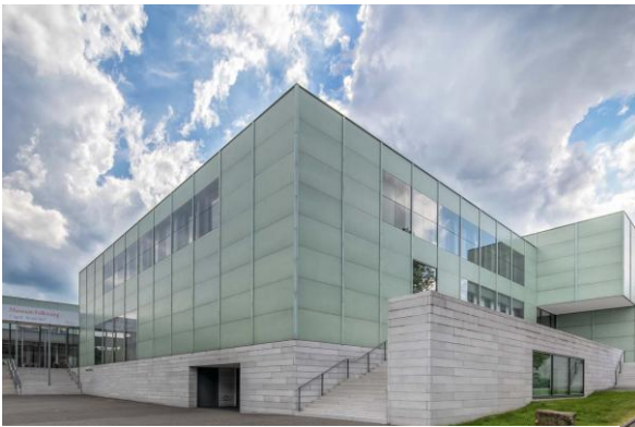
Museum Folkwang, Chipperfield-Building

Cézanne, Modersohn-Becker and Gauguin meet works by Rothko, Pollock, Richter and Fritsch: Museum Folkwang is one of the most renowned German art museums with an outstanding collection of 19th-century painting and sculpture, classical modernism and art after 1945, as well as photography. In addition, Museum Folkwang houses comprehensive collections of graphic art, archaeology, world art, decorative arts and the German Poster Museum. Museum Folkwang is particularly renowned for its international exhibition programme.