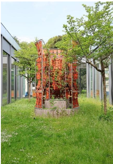
Yussef Agbo-Ola BÍBÍ: 3 Seed Altar , 2025 Photo: Jens Nober, Museum Folkwang, Essen © Yussef Agbo-Ola